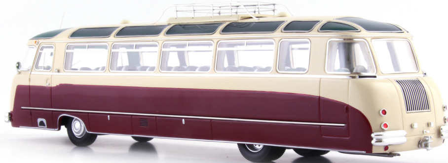
BUSES Krauss Maffei KML 110 (D, 1959) dark red / ivory 250 mm (scale 1/43) #10010