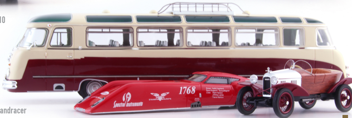
RACING Triumph GT6 C/BFMS Landracer (GB/USA, 1971/2010) red, 140 mm (scale 1/43) #07027